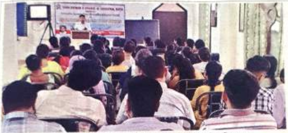
कार्यक्रम को संबोधित करते मुख्य वक्ता व कार्यक्रम में उपस्थित विद्यार्थी व स्टाफ।