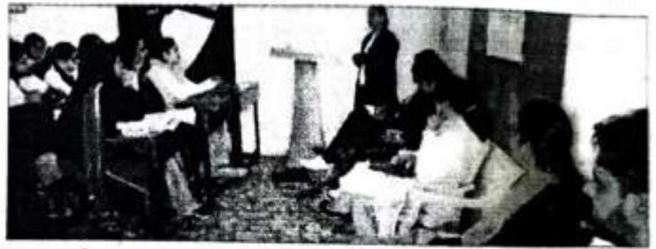
राष्ट्रीय सुरक्षा दिवस पर आयोजित कार्यक्रम में उपस्थित सदस्य। स्रोत: स्थान

मुख्य अतिथि ने कहा कि हर साल चार मार्च को राष्ट्रीय सुरक्षा दिवस मनाया जाता है। यह दिन कार्यस्थल और इसके आसपास के समुदाय में सुरक्षा और कल्याण को बढ़ावा देने के लिए काम करता है। सुरक्षा को बढ़ावा देने के अलावा यह सुरक्षा की ऐसी एक संस्कृति बनाने के महत्व को भी बढ़ावा देती है।